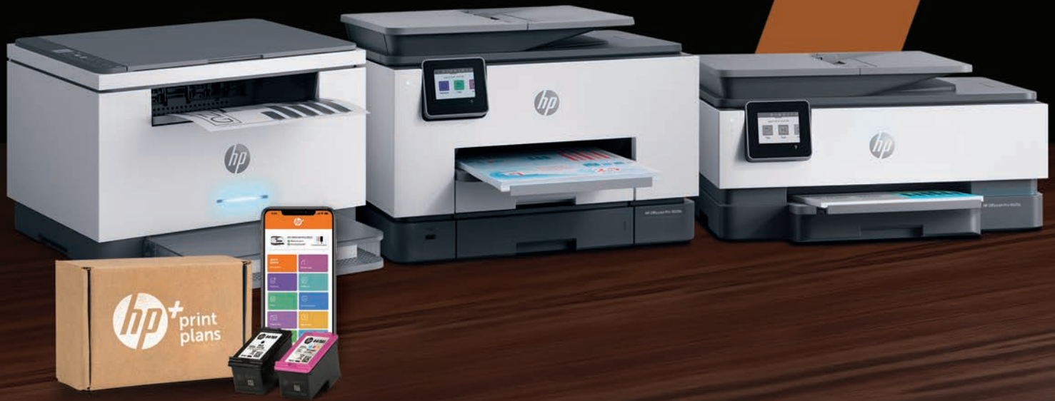
OfficeJet Pro 8000e series